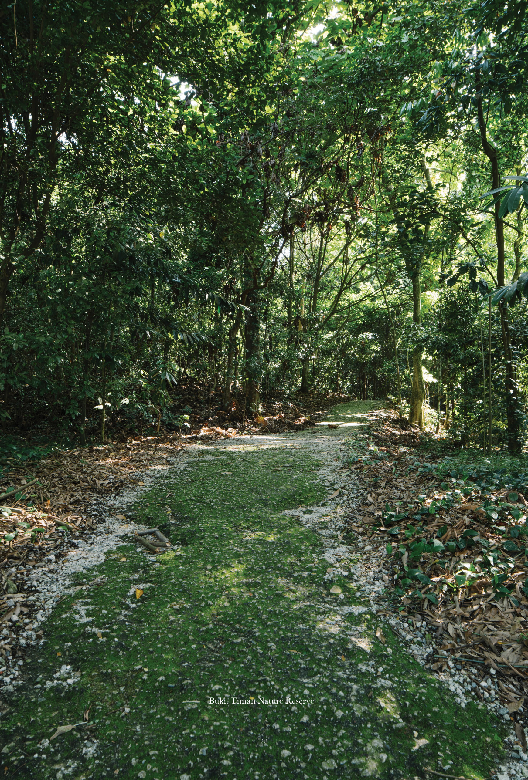
Bukit Timah Nature Reserve