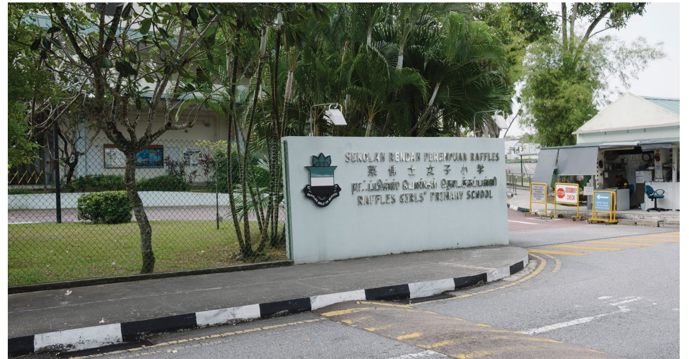
Raffles Girls' Primary School