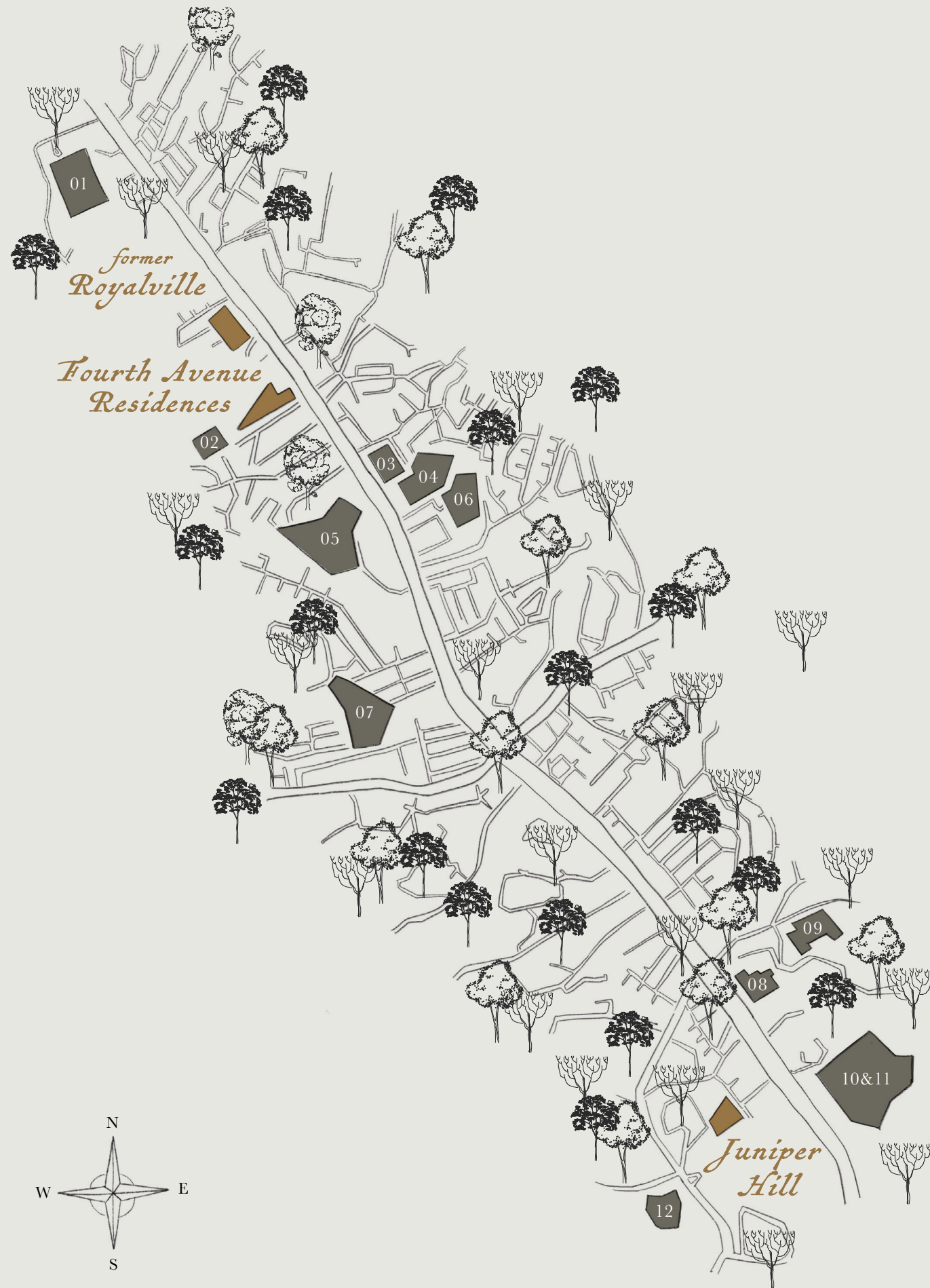
MAP IS NOT DRAWN TO SCALE