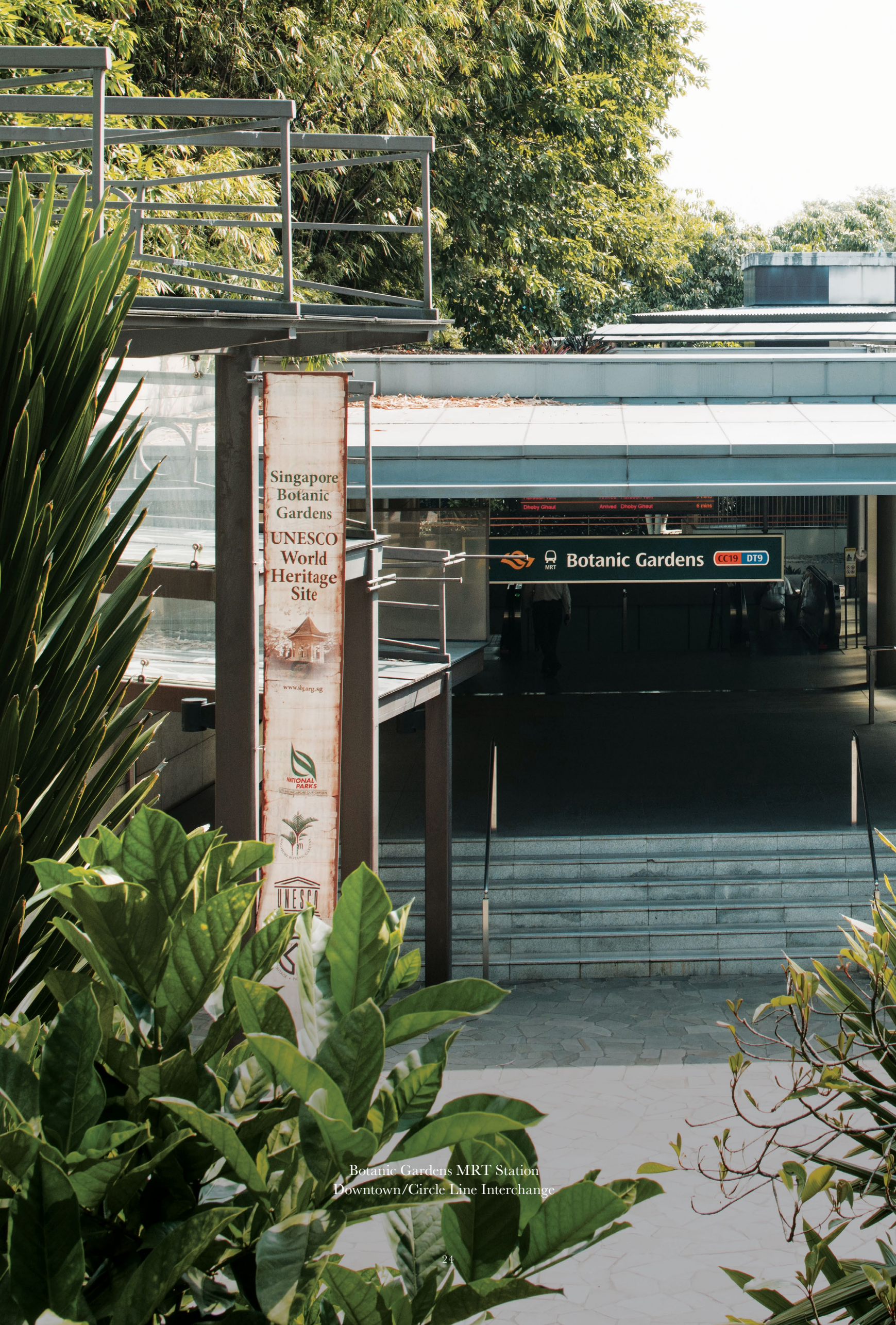
Botanic Gardens MRT Station Downtown/Circle Line Interchange