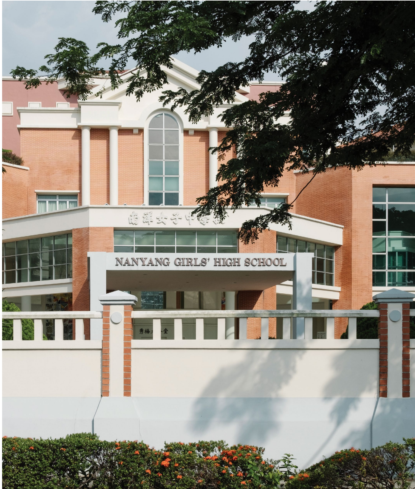
Nanyang Girls' High School