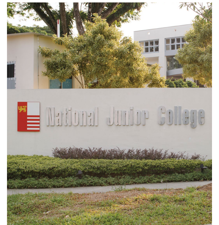
National Junior College