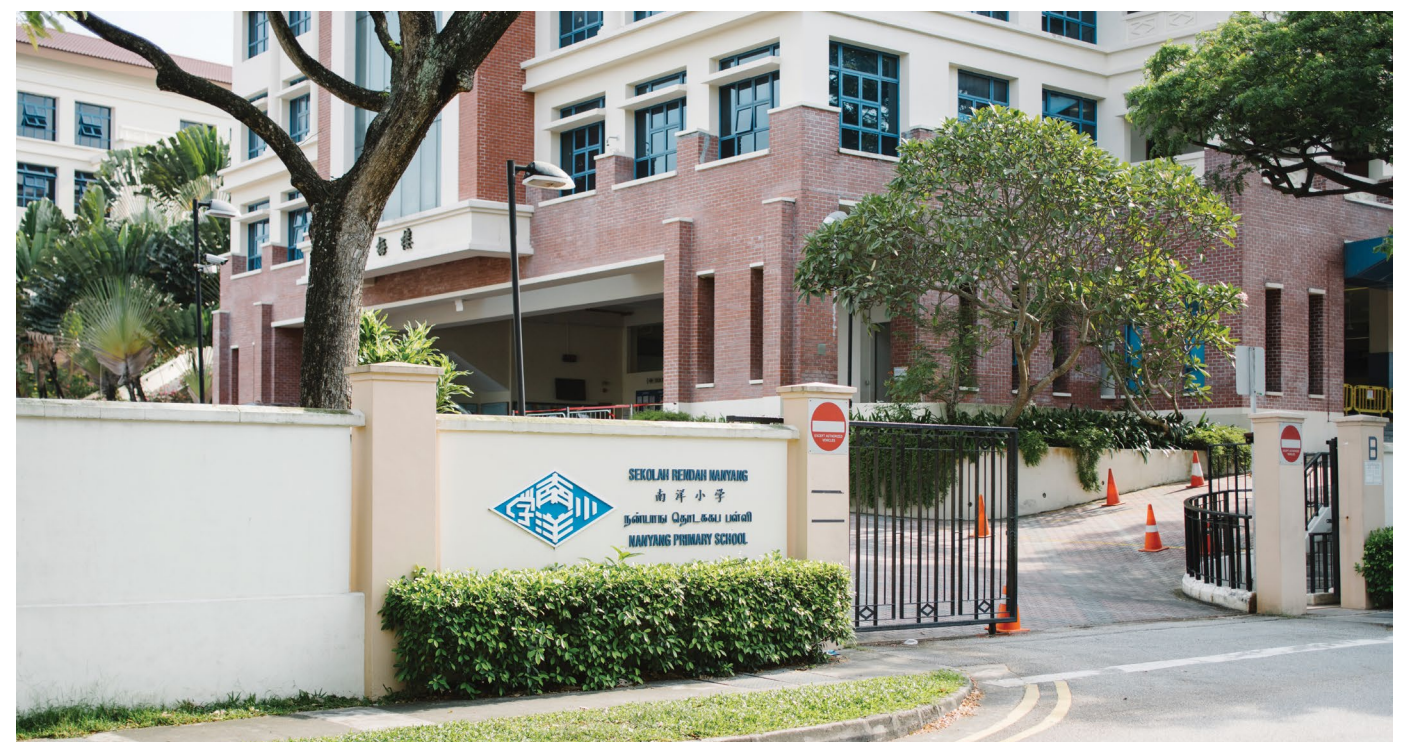
Nanyang Primary School