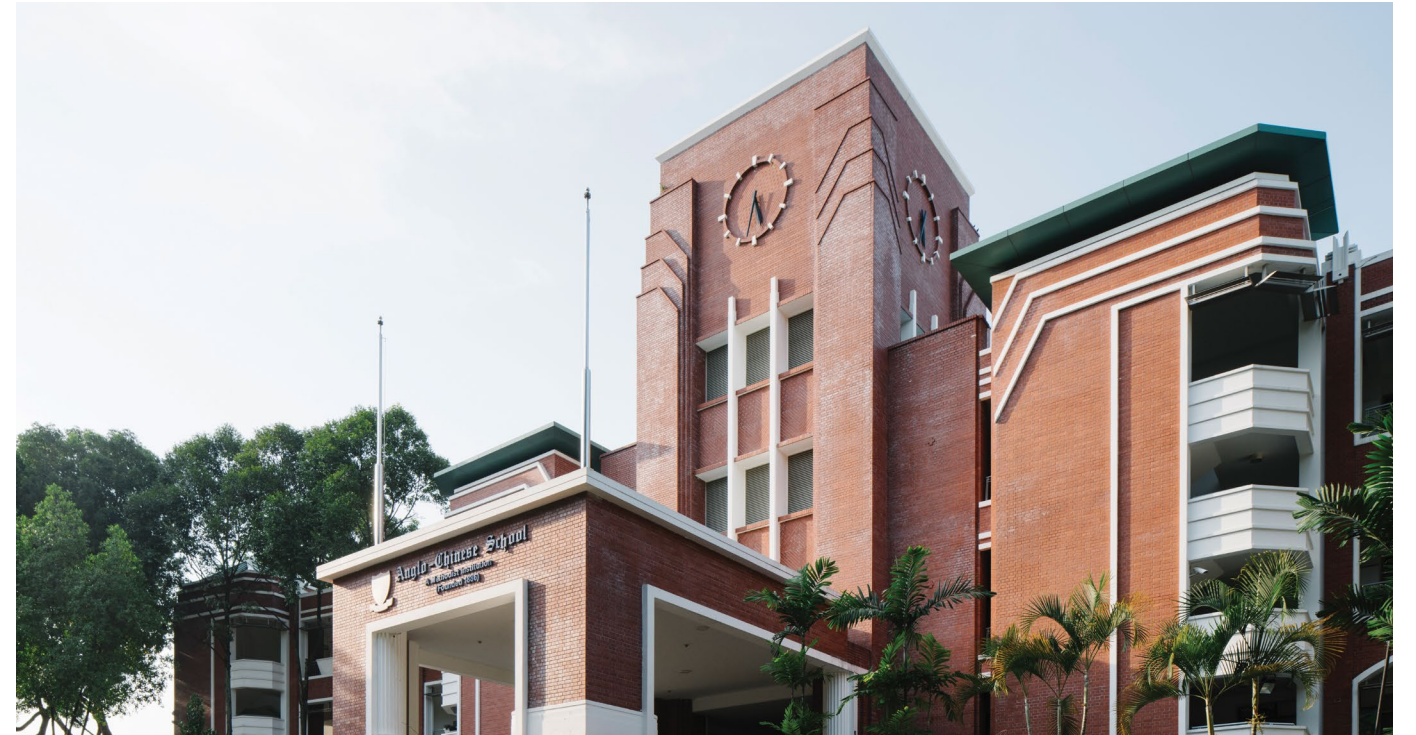
Anglo-Chinese School (Barker Road)