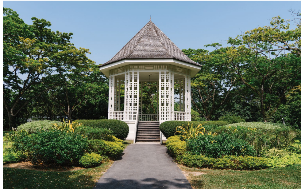
Singapore Botanic Gardens UNESCO World Heritage Site