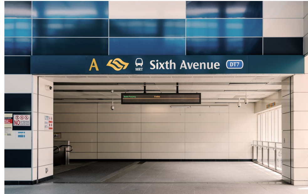
Sixth Avenue MRT Station Direct access from Fourth Avenue Residences and walking distance from former Royalville