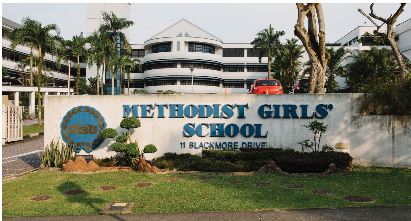
Methodist Girls' School (Primary/Secondary)