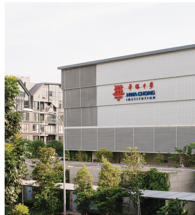
Hwa Chong Institution