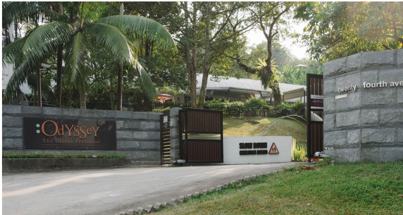
Odyssey The Global Preschool