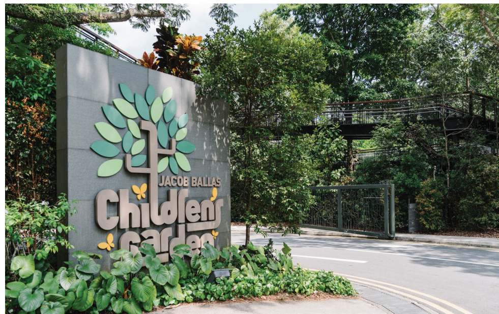
Jacob Ballas Children's Garden