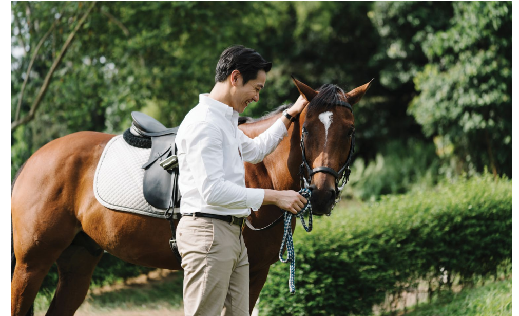
Bukit Timah Saddle Club