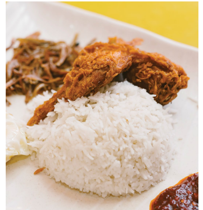
Adam Road Food Centre