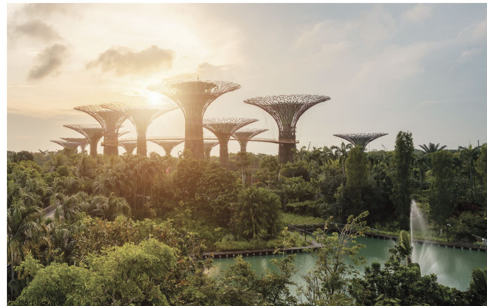
Gardens by the Bay Connected by Downtown Line

A world of possibilities abounds with the introduction of the Downtown Line. Spend the day with nature or indulge in a little retail therapy. The choice is all yours.